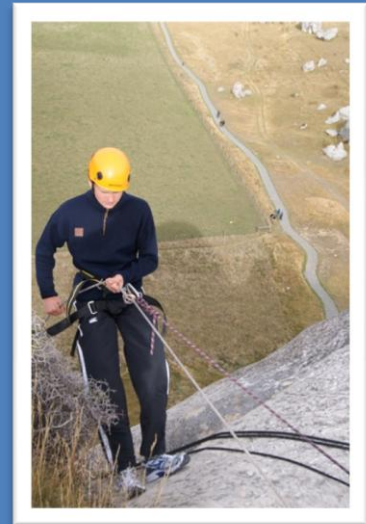
Abseilen aus 150 m im Fach Outdoor Education!

In Neuseeland ist vieles anders als in Deutschland. Schule macht Spaß, die Lehrer sind unglaublich nett und kümmern sich um jeden Schüler. Am meisten vermisse ich seit meiner Rückkehr meine Gastfamilie, meine Kiwi-Freunde und die Freundlichkeit und Herzlichkeit der Kiwis.