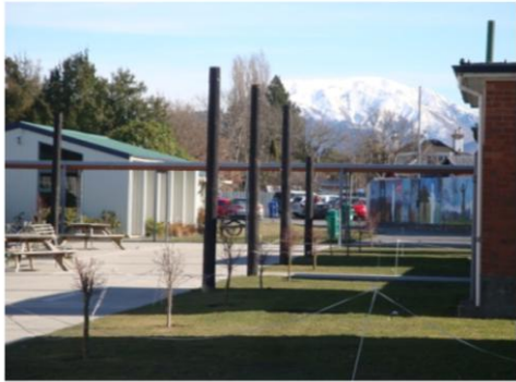
Mt Hutt College mit Blick zum Mt Hutt